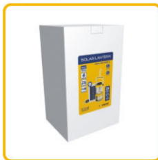
White Box with Label