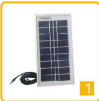
2.5W Solar Panel (262x135x18mm)