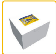
White Box with Label