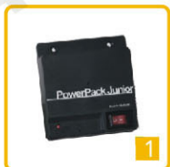
3.6V Battery PowerPack