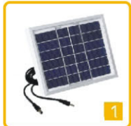
1.5W Solar Panel (147x112x18mm)