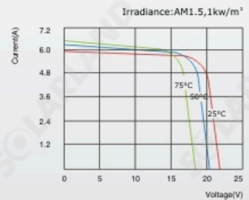
SLP100-12U I-V Curves